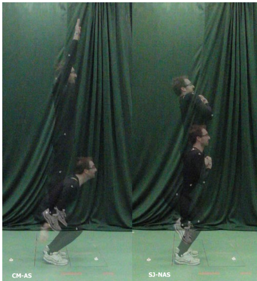
Figure 3. Overlay images for the best two jumps of each type. The peak height reached with the CM-AS was 14.5cm (40.2%) higher than the SJ-NAS.